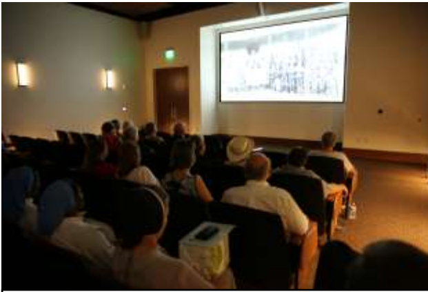
A video being shown in the Theater

already on display. In addition to the showing of an introductory video that sets the atmosphere before you experience the Main Exhibit area, this space also allows for the possibility of viewing other video programs and exceptional presentations. A good example is the photograph below. Paweł Piekarczyk was a special last minute guest. He is traveling Polonia here in America,