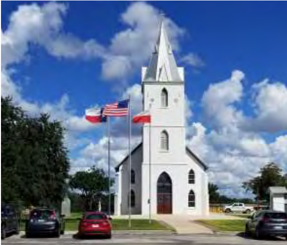
Immaculate Conception of the Blessed Virgin Mary Church, Panna Maria, Texas