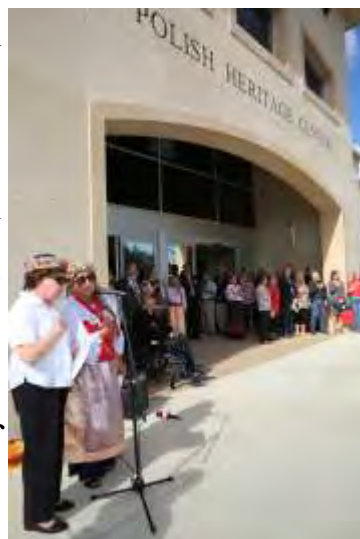
Gathered crowds awaiting the ribbon cutting