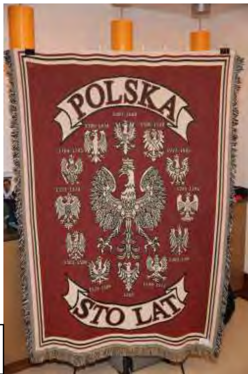
Polish banner of Sto Lat, Good Luck, Good Cheer!

The Grand Opening event, of course, was a two-day celebration! Sunday featured, as mentioned earlier, the Jagoda Dance Troop who continued to dazzle and delight visitors in the spacious Theater with their exposition of the dancing styles celebrated in Poland. Their brightly colored outfits and happy smiles conveyed the joy that the dance troop shared with those present for their perfor-