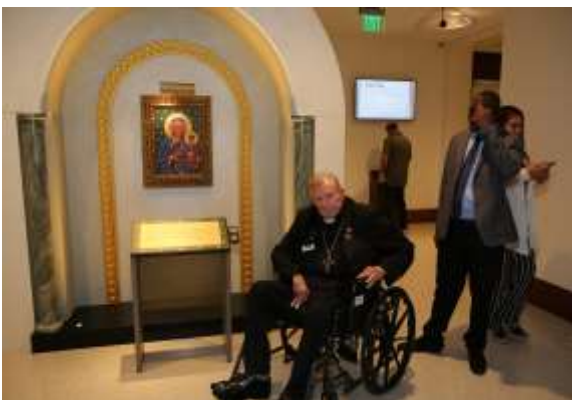
Bishop Yanta next to the image of the icon of Our Lady of Czestochowa

The Polish Heritage Center also had its own merchandise to mark the occasion. Among the offerings were two different mugs, two distinctive cloth bags, a beautiful commemorative Christmas ornament, a PHC face mask, lapel pin, and a commemorative “coin.”