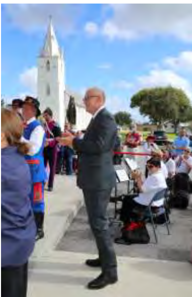
Musicians entertaining at the Grand Opening