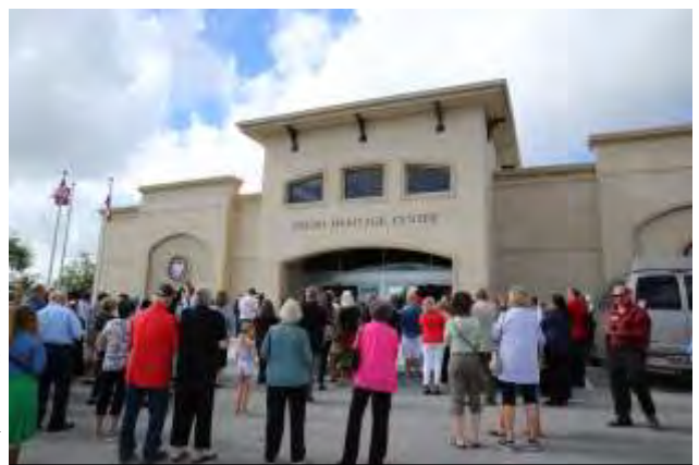
Gathered crowds awaiting the ribbon cutting

years ago, a group of intrepid Polish immigrants sold all that they possessed, traveled from the land of their ancestors by rail to the Prussian seaport of Bremerhaven, where they boarded the Weser and the Antonette . They began a nine-week voyage and arrived at the Gulf port of Galveston in early December of 1854. The next segment of their trip via ship to the then thriving port