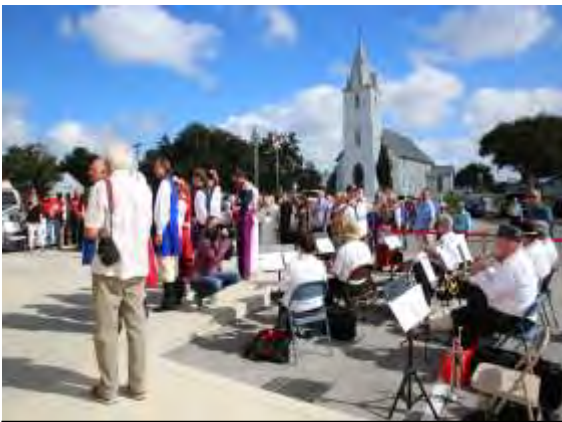
Gathered crowds awaiting the ribbon cutting

find only with those who have dedicated many years to preserving and teaching this custom from the Homeland of Poland. In keeping with the custom, the dancers' ages ranged from young adult to middle age.